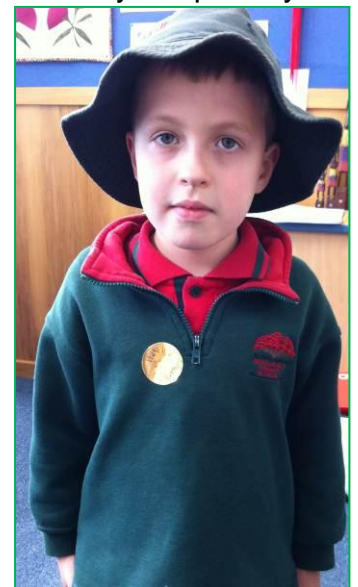
Tuesday. Special sprints final.