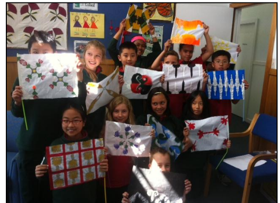
Well done the ABs with designer flags

At the end of this newsletter I have included some photos and comments on my sabbatical.